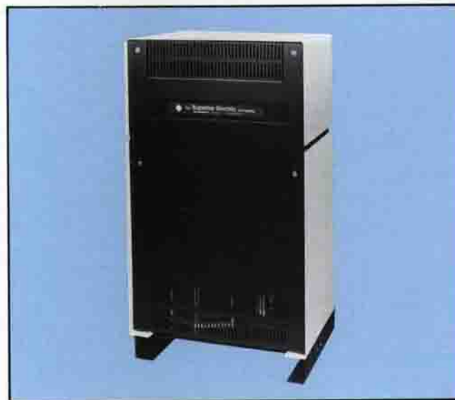
NEMA I Enclosure